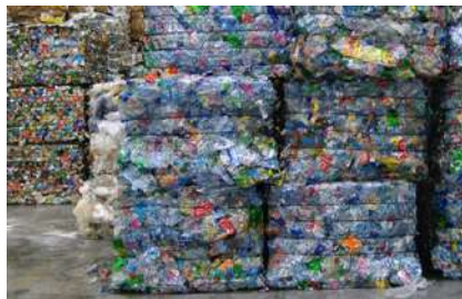
Compresses paper, cardboard, plastic film and PET bottles