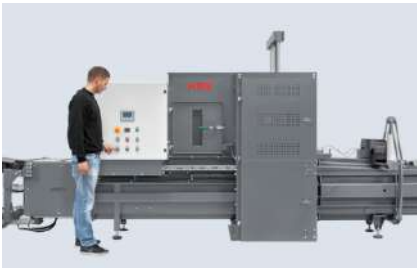
Operating side can be selected