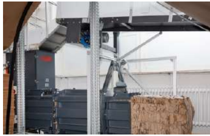
Integration into automated industrial production processes