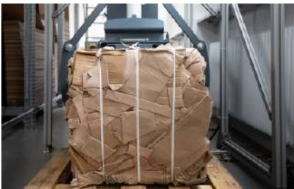
Available as an option with manual strapping