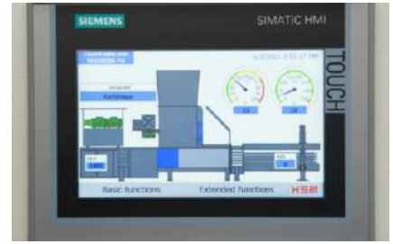
Control of the pressing process via light barrier