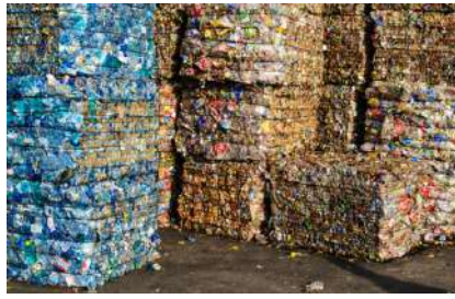
High compression and bale weights