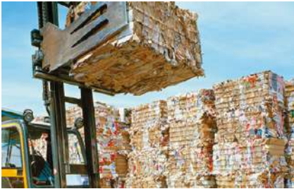
Particularly suitable for compression of paper, cardboard and plastic film