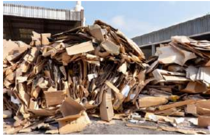
Versatile solution for materials up to approx. 50 kg /m 3 bulk weight