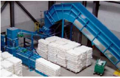
Integration into automated industrial production processes