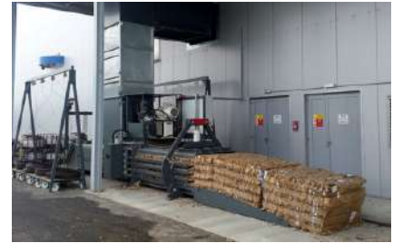
Suitable for almost all requirements. Contact us if you have other materials or applications. We will find you a suitable solution.