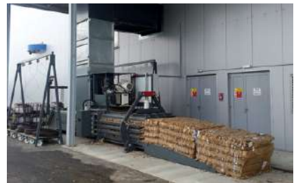
Suitable for almost all requirements. Contact us if you have other materials or applications. We will find you a suitable solution.