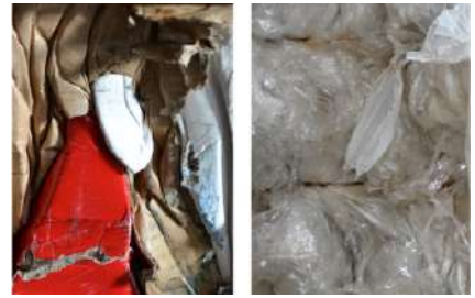
Particularly suitable for compression of cardboard and plastic film