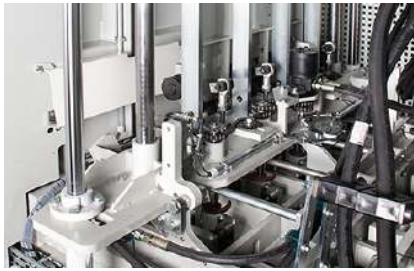
Fully automatic vertical strapping