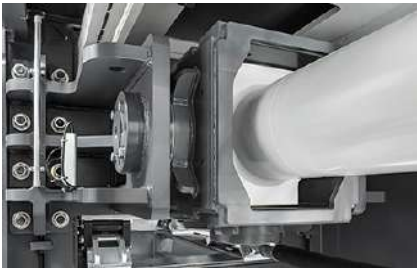
Gimbaled press cylinder system - Reduced wear on the pressing cylinder and press ram guides