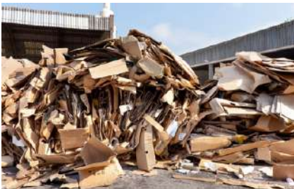
Versatile solution for materials up to approx. 60 kg /m 3 bulk weight