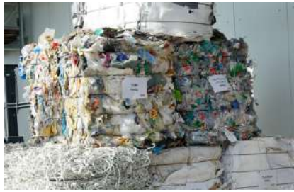
Suitable for cardboard, plastic film and compressing DSD goods, UBC as well as PET bottles (other materials on request)