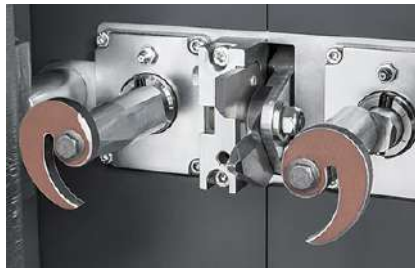
Solid steel construction with extremely wear-resistant, replaceable steel